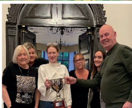
QUIZ CHAMPIONS CROWNED