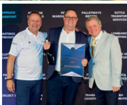
TOP LOGISTIC AWARDS WIN