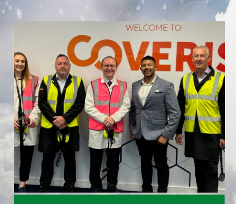
NEW COVERIS FACILITY OPENED BY LOCAL MP

Updates from around the Winsford 1-5 estate