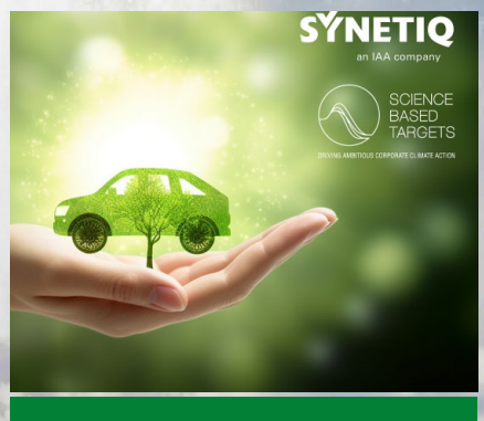
SYNETIQ COMMITS TO HALVING EMISSIONS BY 2032