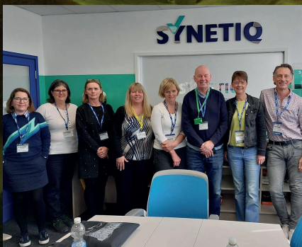
WINSFORD 1-5 PLAYS HOST TO BID FORUM

Updates from around the Winsford 1-5 estate