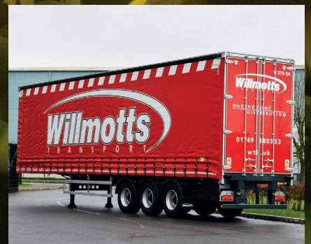
TIGER TRAILERS FULFILS YET ANOTHER ORDER