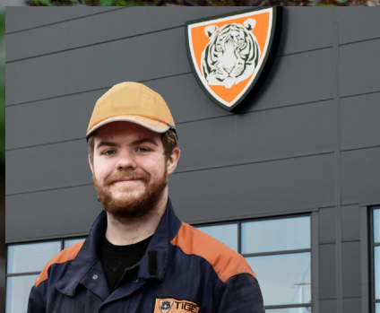
TIGER TRAILERS ADDS TO ITS GROWING TEAM