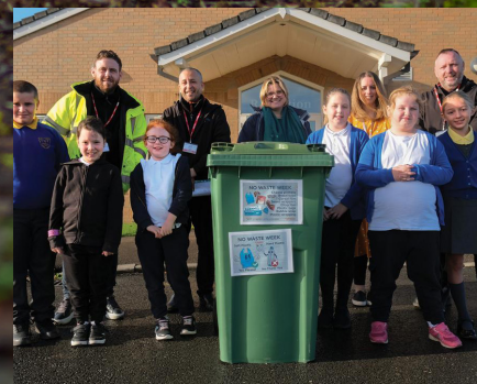
COVERIS LAUNCHES RECYCLING EDUCATION PROGRAMME