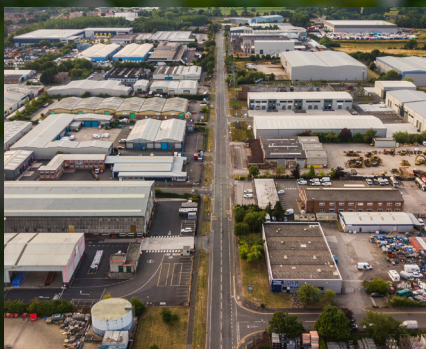
UPDATES FROM AROUND THE WINSFORD 1-5 ESTATE