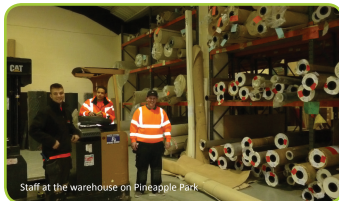
Staff at the warehouse on Pineapple Park