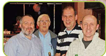
Second place, the team from Viridor